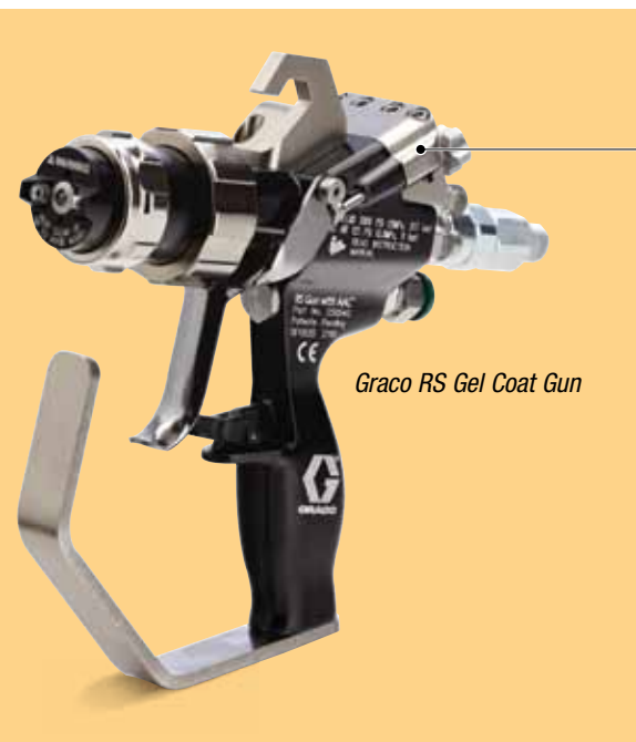
Graco RS Gel Coat Gun

Graco RS Chop Guns and Graco RS Gel Coat Guns are both available in internal and external mix models.