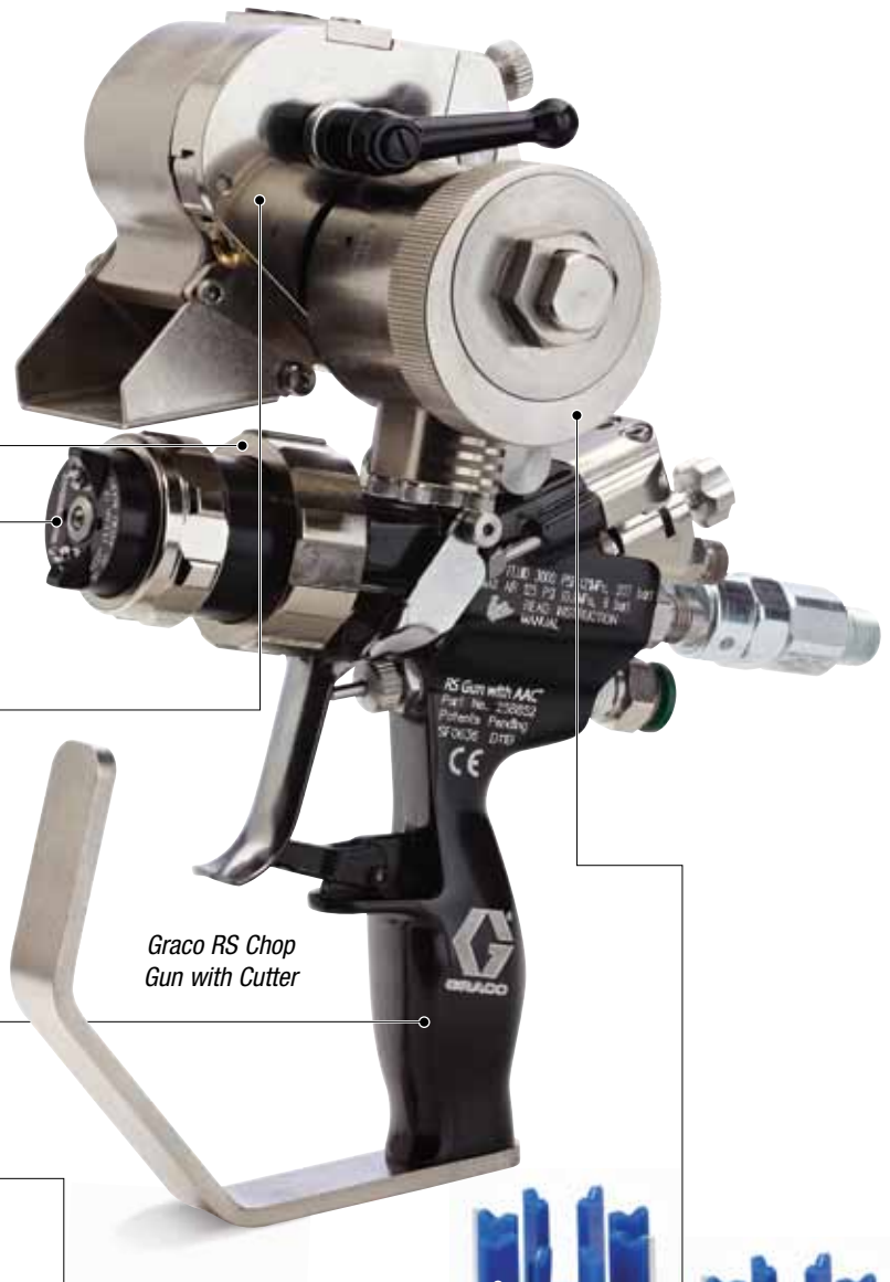
Graco RS Chop Gun with Cutter